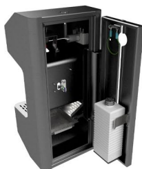
Easy service access