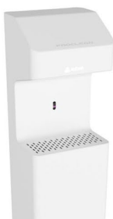
Available in white colour

5 liter liquid container (liquid not included)