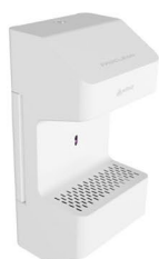
Available in white colour