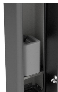
Easy access to the liquid